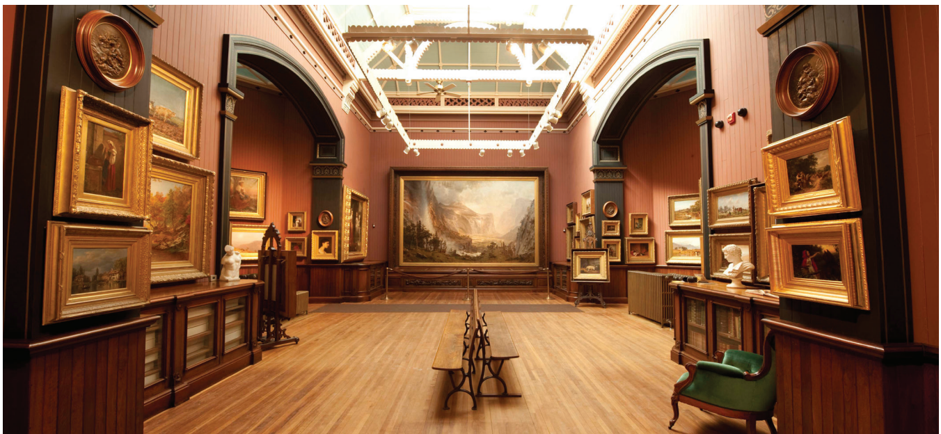
St. Johnsbury Athenaeum

The number of visitors to Jay Peak, Burke Mountain, Kingdom Trails, and the Burke Mountain Academy is about 750,000 a year and growing. These visitors are expressing increased interest in arts and related activities and experiences. A well-designed partnership could help the outdoor recreation industry maintain its growing customer base and expand market opportunities for creative enterprises.