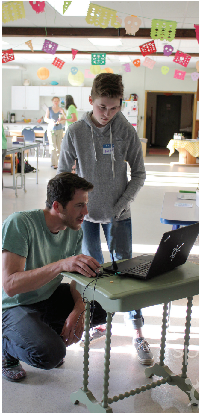
Spark collaborative work space in Greensboro.

The goals and actions recommended here are intended to further strengthen the Northeast Kingdom's creative industries while taking into account the rural nature of the region and the needs of less advantaged communities. Each of the goals is followed by a series of possible actionable recommendations. Recognizing that there are far too many actions to pursue, we expect the team to establish priorities and make necessary modifications to match needs and available resources.