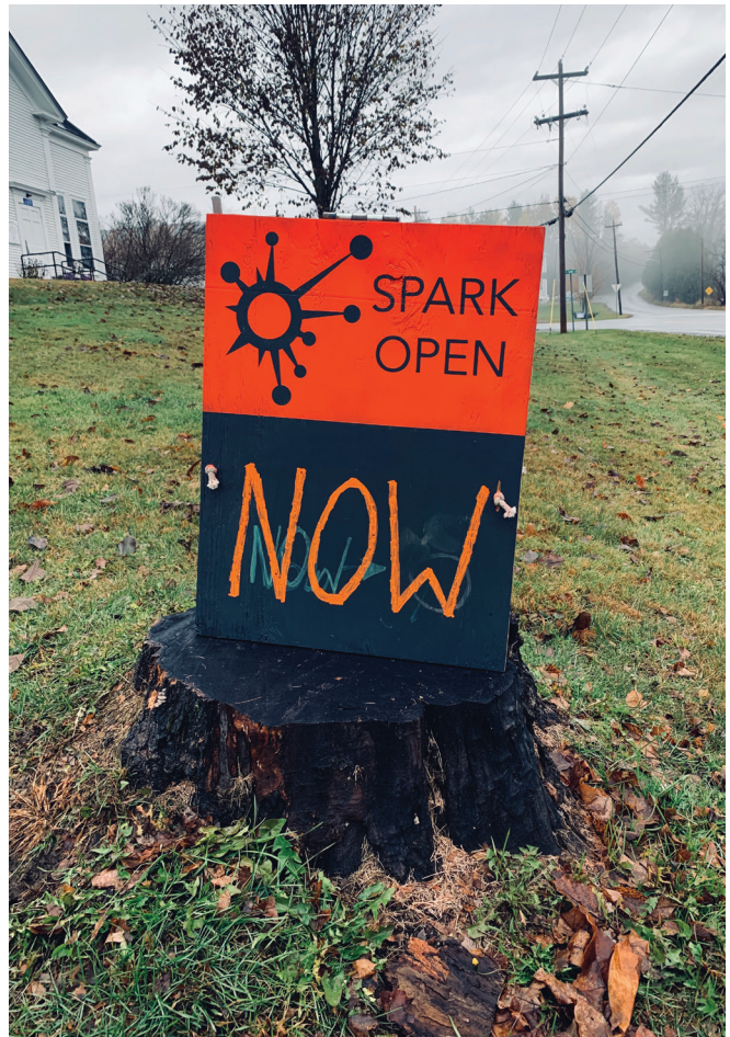
Spark collaborative work space in Greensboro.

The empirical old and imaginative ordinary must be integrated with the technological new and a transforming society.