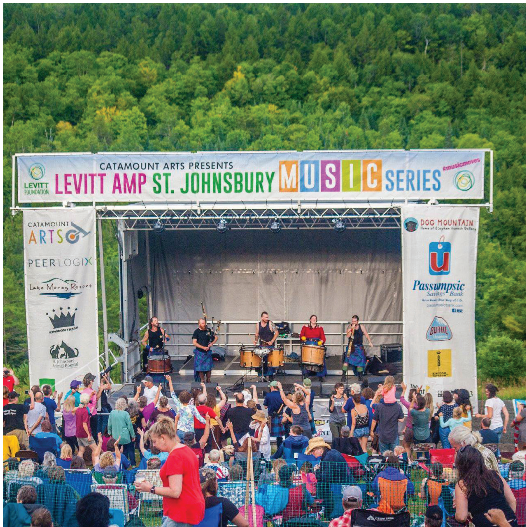
Levitt AMP concert in St. Johnsbury