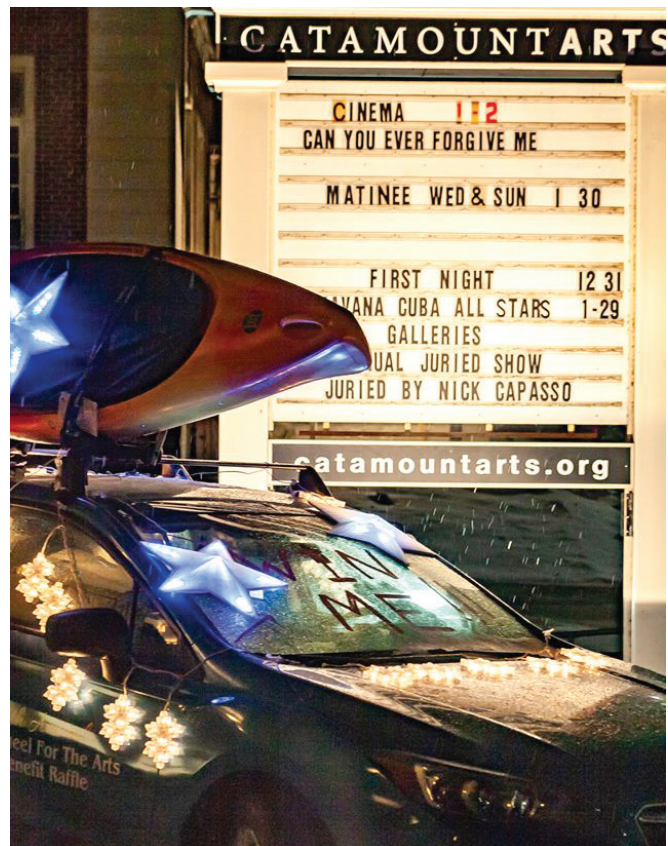
Catamount Arts in St. Johnsbury

This requires businesses and school systems to commit the time and resources to create the opportunities and to mentor and monitor students’