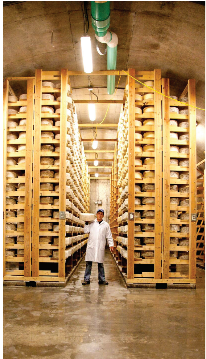
Jasper Hill Farm in Greensboro

From the American Association of Dowers headquartered in Danville to the Museum of Everyday Life situated in Glover, the empirical old and imaginative ordinary must be integrated with the technological new and a transforming society.