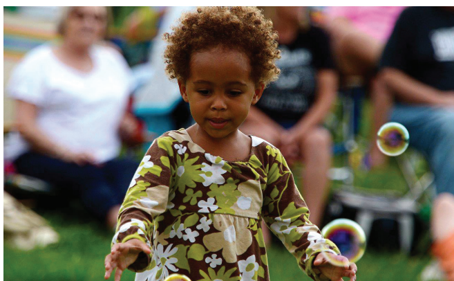
Levitt AMP concert at Dog Mountain in St. Johnsbury

Employees who interact with tourists are potential sources of information who can influence not only where visitors go but also how long they stay and what they spend money on. By training and possibly certifying those on the front line of eating establishments, hotels, and shops as “cultural hosts/ambassadors,” visitors could ask them about places to visit, events to attend, and local history and culture.