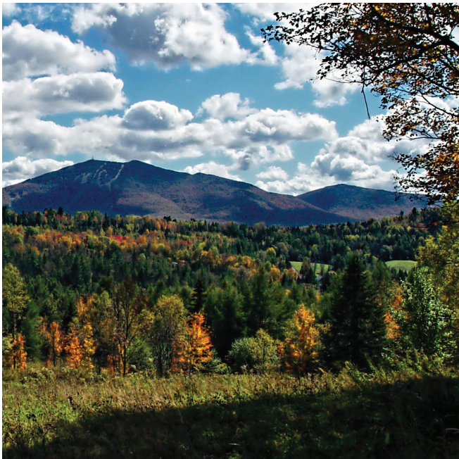
Burke, in Vermont's Northeast Kingdom.

Vermont's three most northeastern counties, named the Northeast Kingdom back in 1949, make up the state's most rural and least wealthy region. Therefore, perhaps more than any other region, the Kingdom has had to rely on an unusually rich—some might call it quirky—type of ingenuity and craftsmanship within an equally rich natural environment that is treasured and protected.